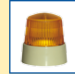
Warning flasher (also available as Ex-version)