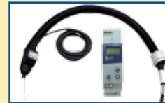
Heated extraction pipe