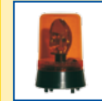
Rotating mirror lamp (also available as Ex-version)