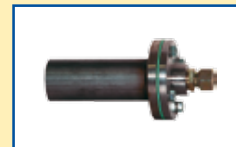
Mounting stubs with single flange