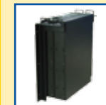
Mains Stand-by supply unit