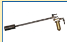
Sampled gas extraction