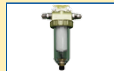
Respirable dust filter with filter cartridge